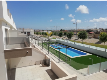
New Build Residential Project Pilar de la Horadada

New Build Residential Project Pilar de la Horadada *ASK US ABOUT THE PARAMOUNT NEW BUILD DEAL* Located in Pilar de la Horadada this new build residencial project is in one of the most charming areas of the Costa Blanca, with the beaches and amenities just a short walk away. You could reach one of the most outstanding beaches in the area through a nice walk in "The Rambla" which will take you direct to "Playa de las Higuericas". There are 40 properties in this new phase which will set to be completed in January 2024. Most of them facing South -West and all the properties face the communal swimming pool, a park and the Rambla. Properties will offer a choice of either 2 or 3 bed apartments, ground floor or top floor. There's to plenty to discover nearby, and really live the Mediterranean lifestyle, including Golf Courses, Water activities, Walks through Nature and Commercial Areas. 2 beds Ground Floor from 189.900 € + IVA 2 beds Top Floor from 189.900 € + IVA 3 beds Ground Floor from 224.900 € + IVA